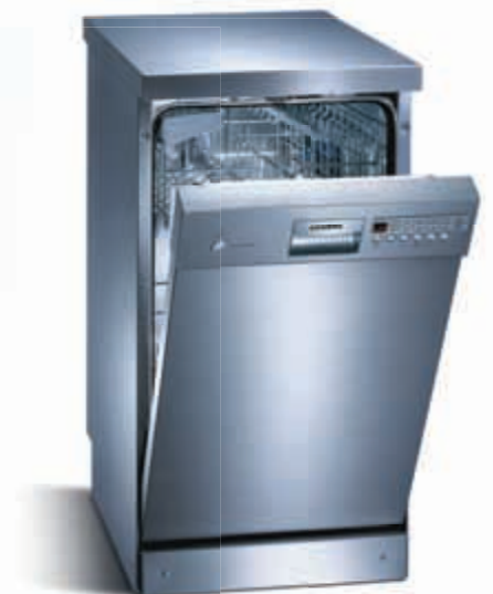
The SF24T558GB slim-line dishwasher in stainless steel finish