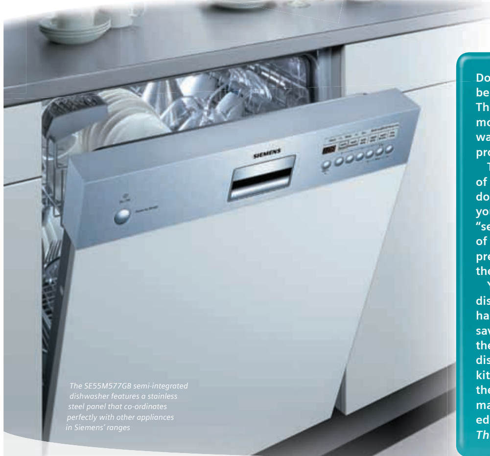
The SE55M577GB semi-integrated dishwasher features a stainless steel panel that co-ordinates perfectly with other appliances in Siemens' ranges

Do consumers really understand the benefits a dishwasher will bring them? The chances are that they do not. To most, a dishwasher saves the hassle of washing up. What an opportunity this provides retailers.