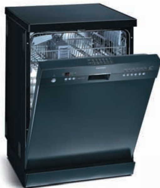
The sensational-looking SE26T652GB dishwasher is part of a new line of black appliances new to the Siemens collection

► No need to do a full load: Siemens' "half load" feature washes smaller loads quickly and efficiently. There is no restriction on where pots and pans are placed either – users simply "load and go".